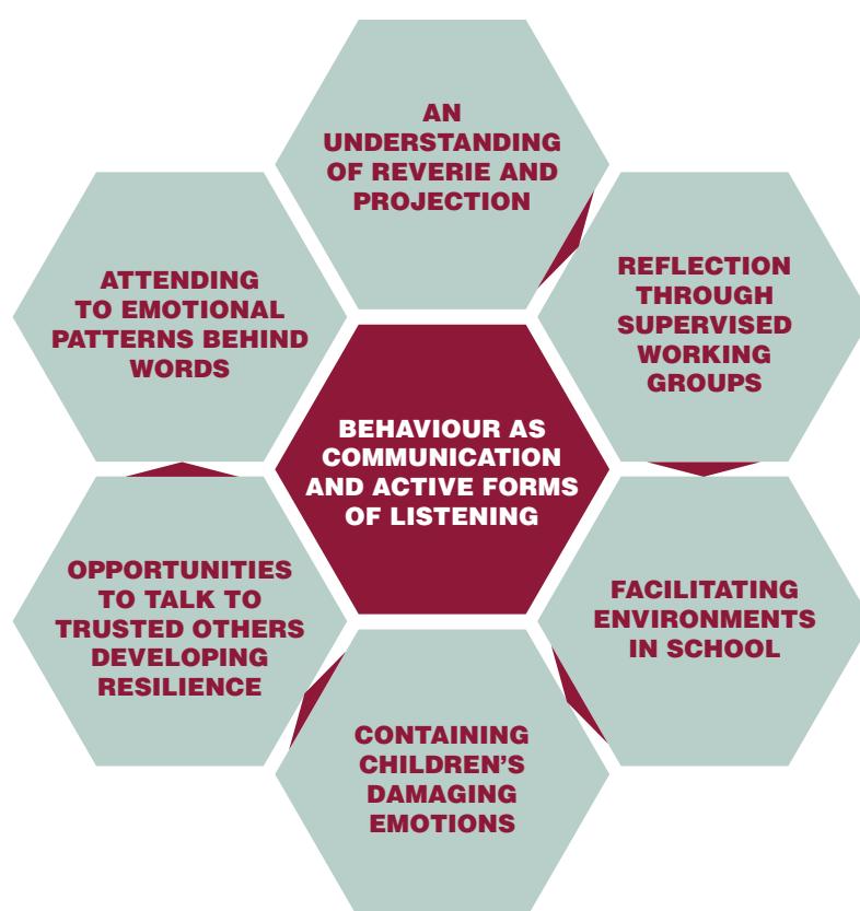
Figure 1: Antecedents to positive language and communication

Inquiring language and other interpersonal strategies such as specific praise, explanation and feedback, behaviour management strategies, non-verbal language use and silence, can be understood as the positive language-based outcomes that spring from the primary antecedents of an understanding of behaviour as communication and active forms of listening.